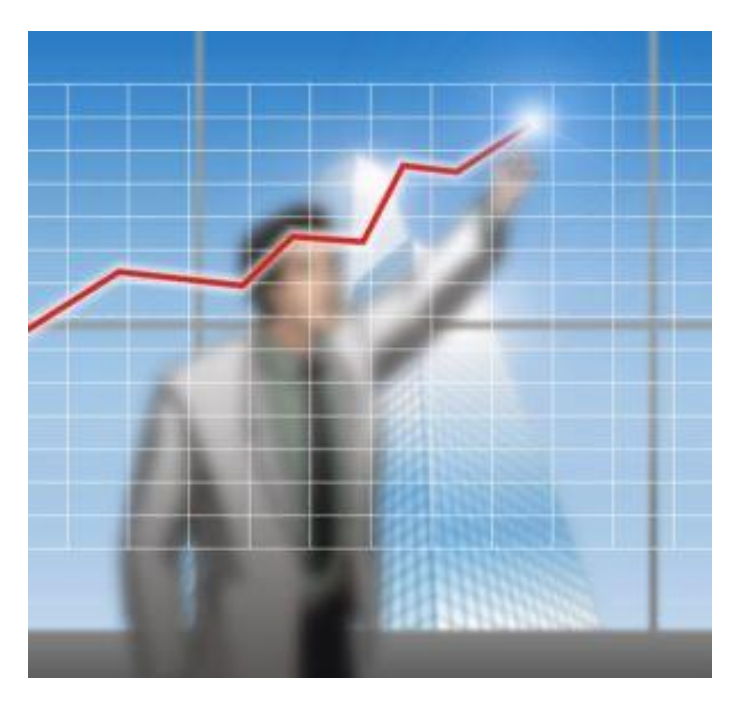
The Online Business Plan

However for many home business owners, the net is more than tool - it's a lifeline that has helped them live and prosper through the current economic climate.